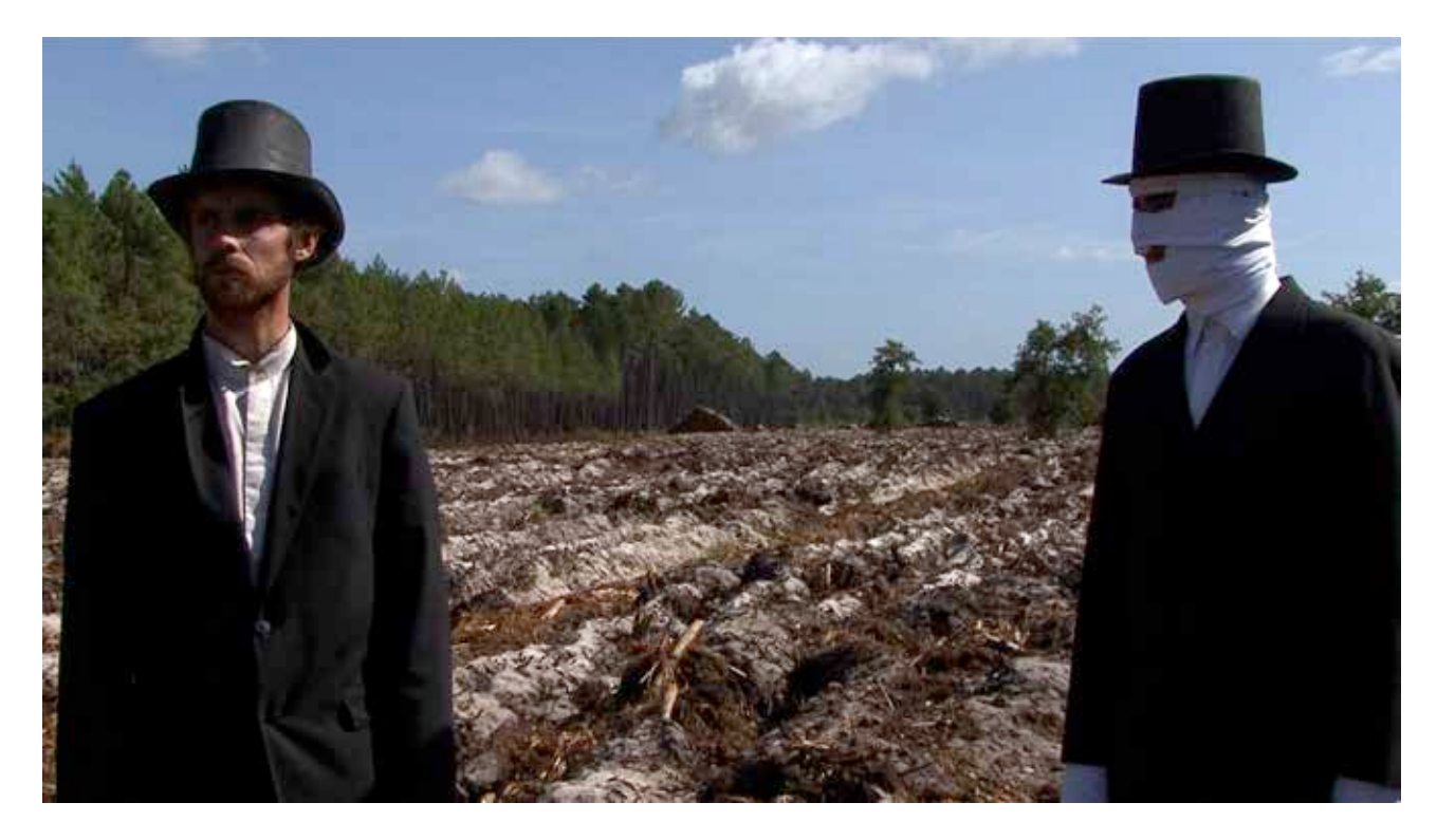
WILD IS THE WIND is a musical (science)-fiction movie.